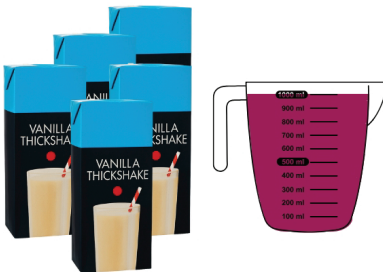
5 cartons + 1000ml of flavouring