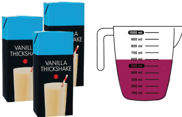
3 cartons + 600ml of flavouring