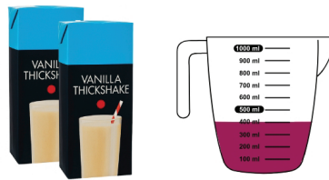
2 cartons + 400ml of flavouring