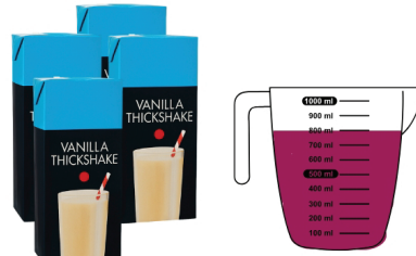
4 cartons + 800ml of flavouring